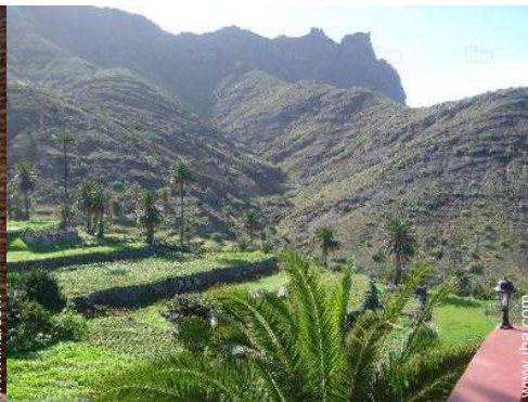
view from the terrace