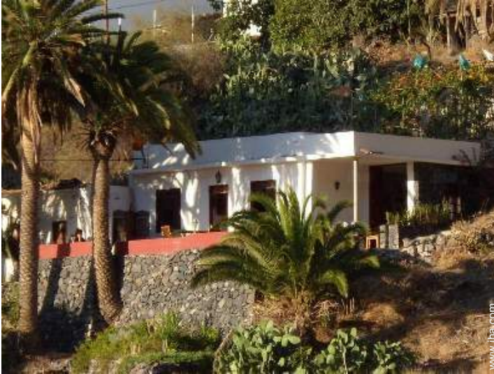
Single family home