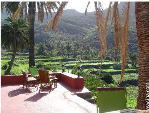
view from the terrace