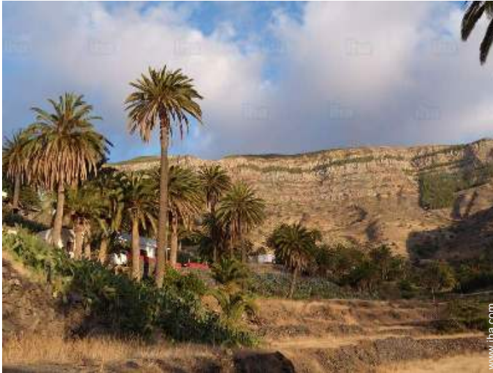
view over the mountain