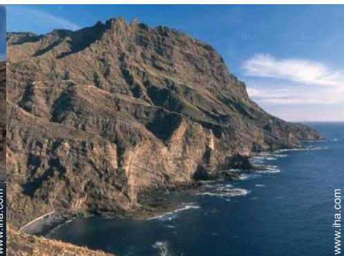
direct access to the beach