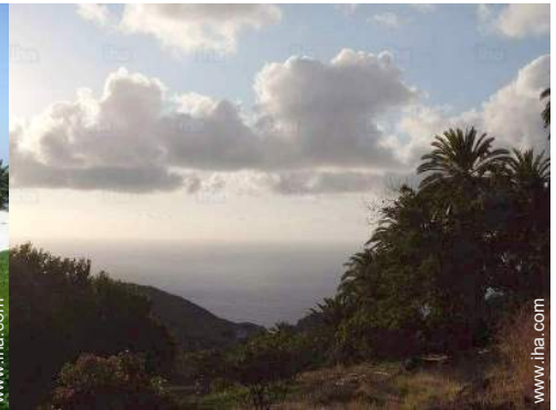
view of the sunset