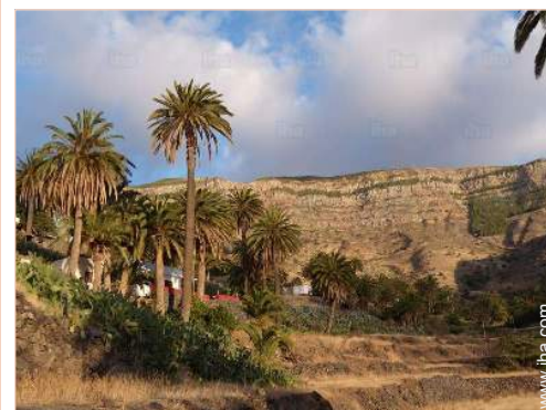
view over the mountain