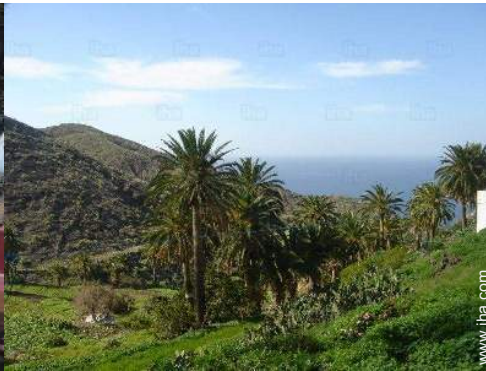
view over the sea