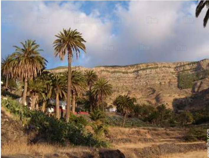
view over the mountain