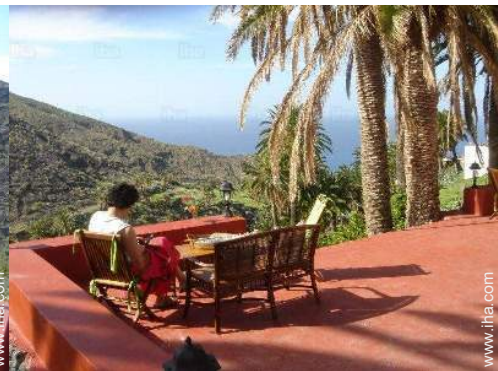
view from the terrace