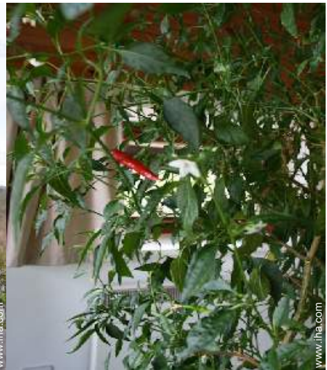
Present on site