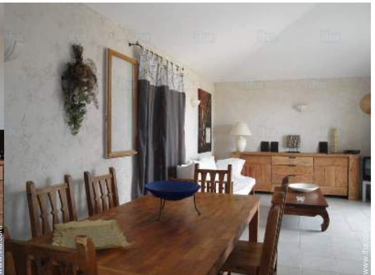
general floor plan