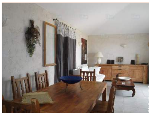
general floor plan