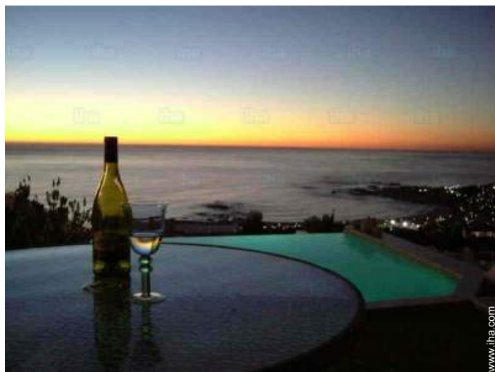
view of the sunset