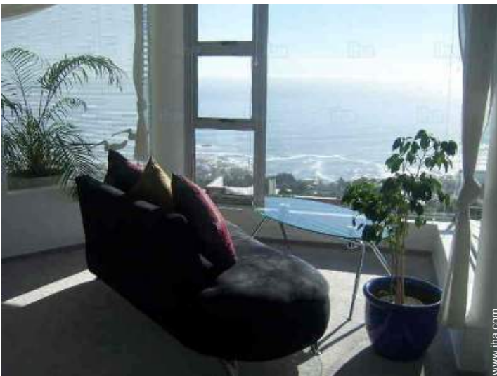
view from the bedroom