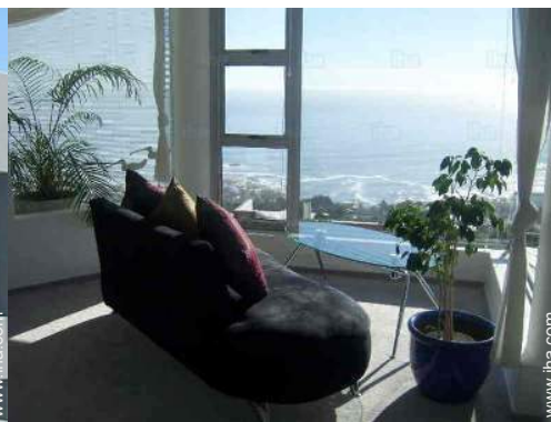
view from the bedroom