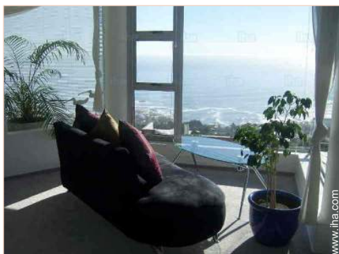
view from the bedroom