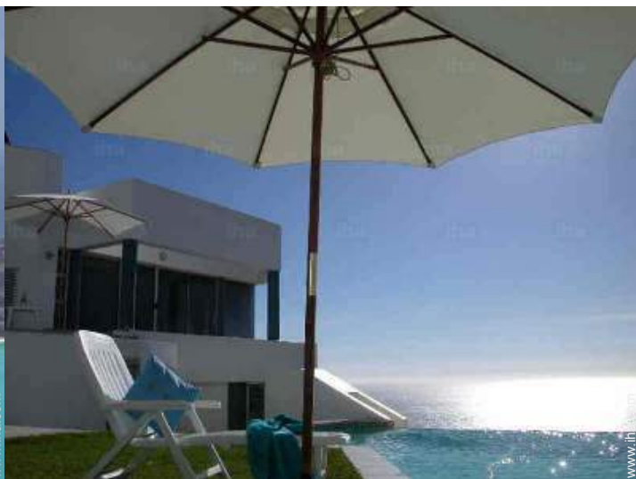
view from the swimming pool