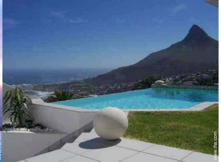
view from the patio