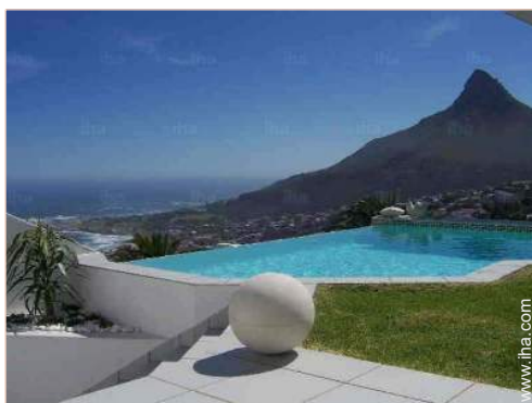
view from the patio