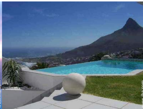
view from the patio