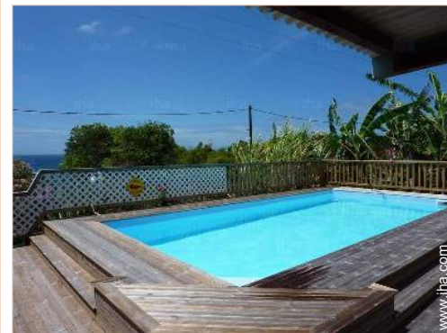
private swimming pool

Village center 0.3mi. Bus stop / bus station 0.3mi. Car rental 6mi. Breadstore 0.3mi. Caterer 0.3mi. Local stores 0.3mi. Supermarket 0.3mi. Hairdressing salon 0.3mi. Mail office 0.3mi. Drugstore 0.3mi. Doctor 0.3mi. Hospital 6mi.