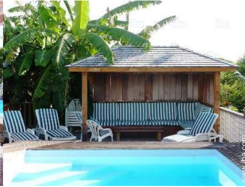
private swimming pool