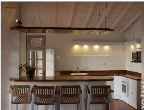
american style kitchen