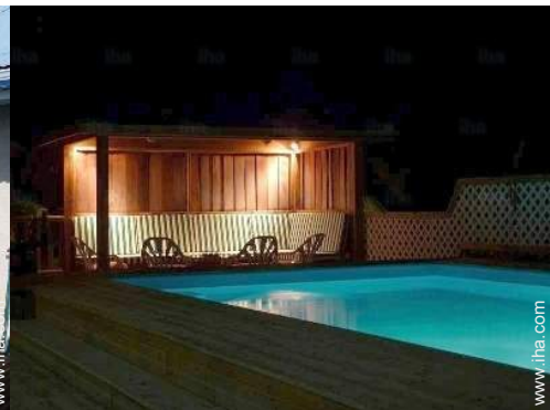
private swimming pool