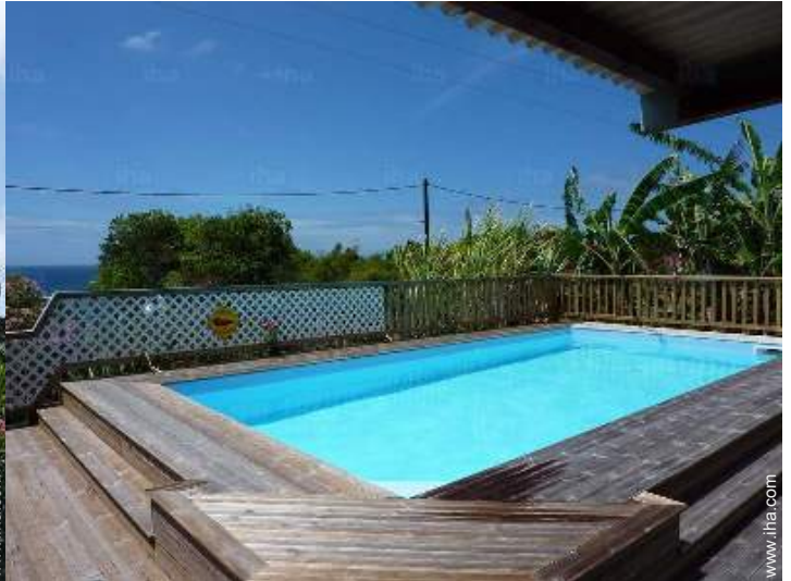
private swimming pool