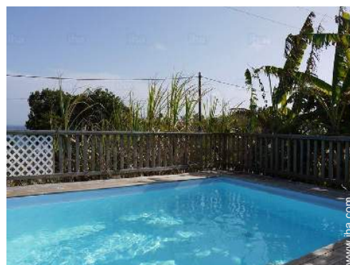
private swimming pool