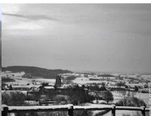
view of the village center