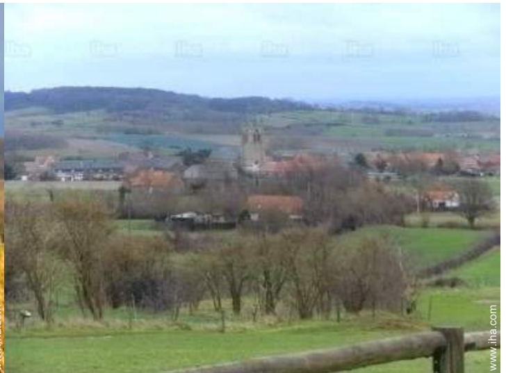
view of the village