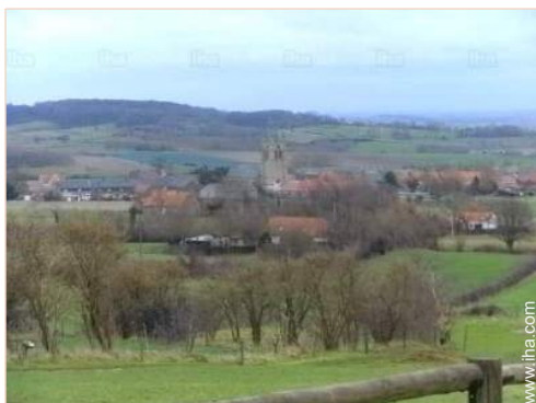
view of the village