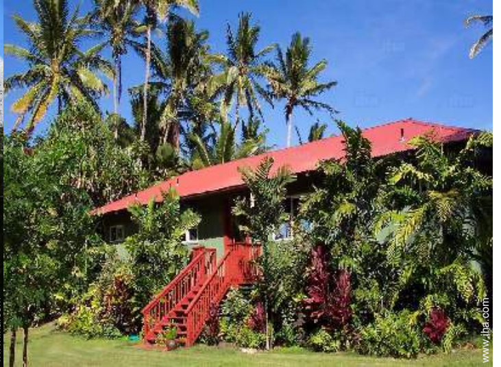
Single family home