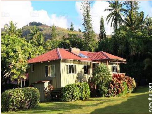
Single family home