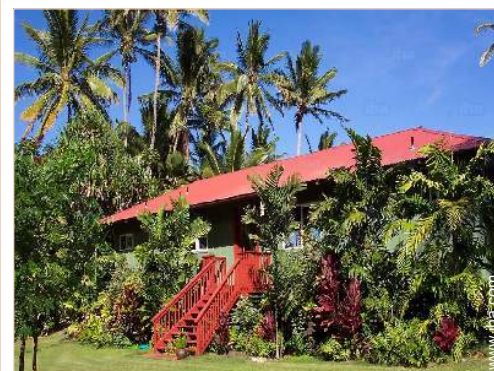
Single family home