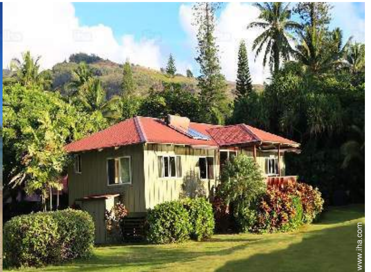
Single family home