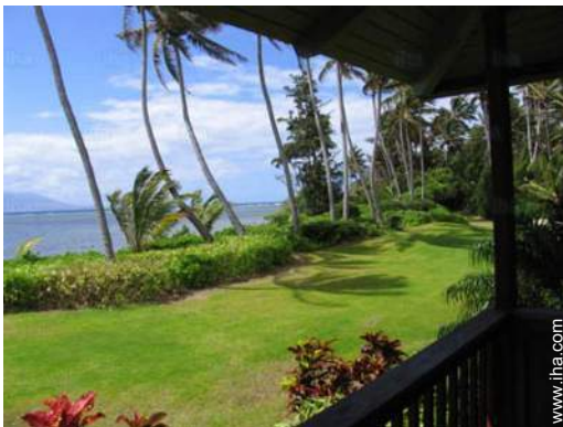
view from the veranda