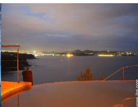
Cascading swimming pool