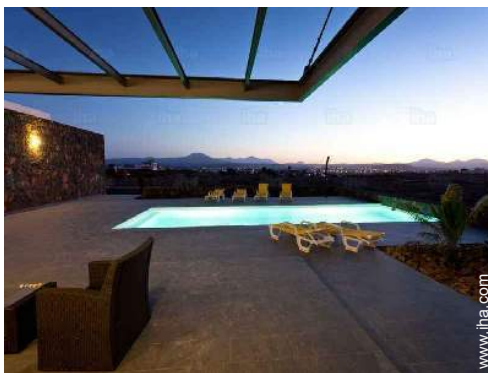
view from the dining-room