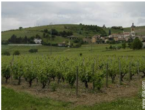
view over vineyard