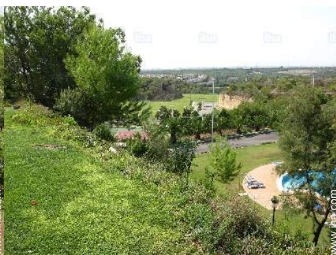
park and garden