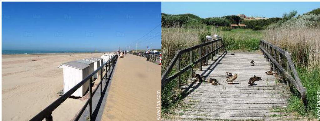
seaside pursuits nearby