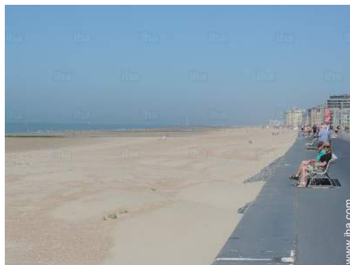
seaside pursuits nearby