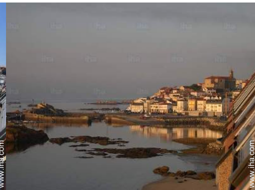
view of the port