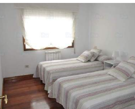
two twin beds