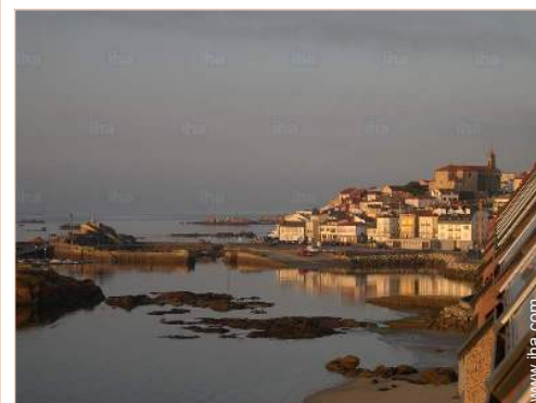
view of the port