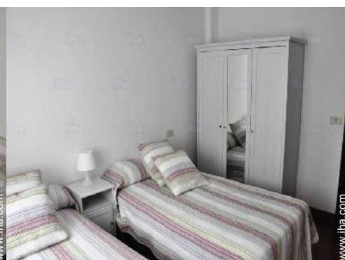
two twin beds