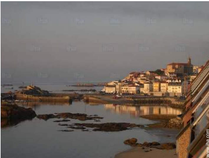
view of the port