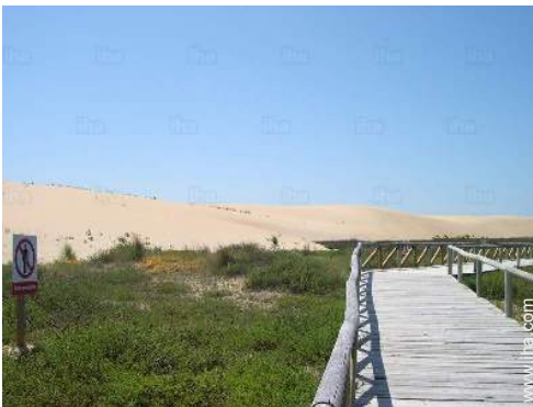
Attractions and relaxation