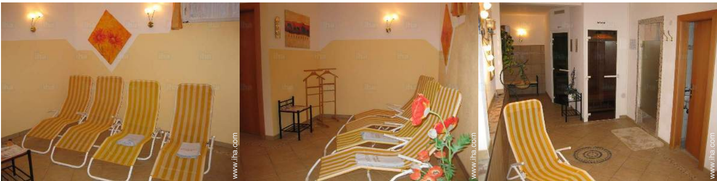
Equipment at the guest's disposal