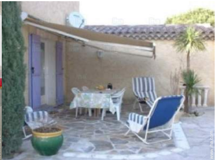
yard seated area