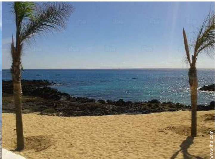
Sea water swimming pool