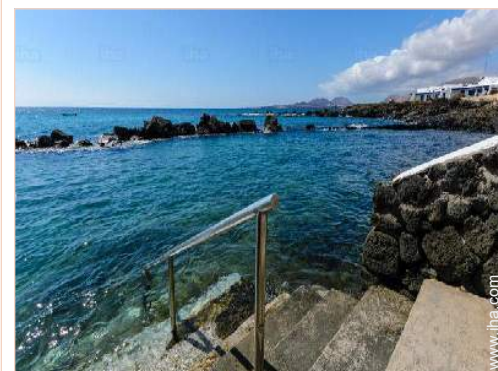
Sea water swimming pool