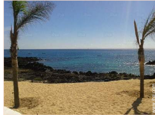
Sea water swimming pool