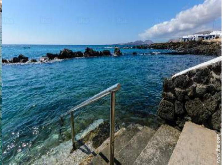
Sea water swimming pool