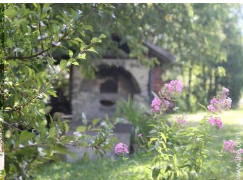
view from the bedroom