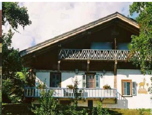
Single family home