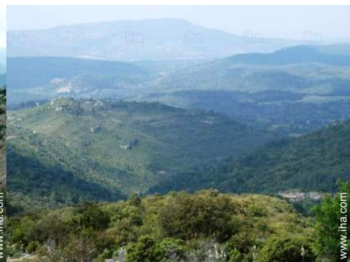
view over the countryside