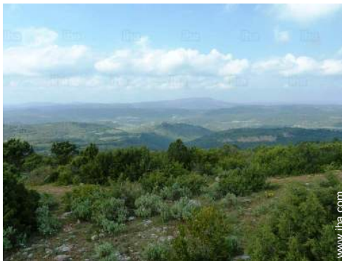
view over the countryside