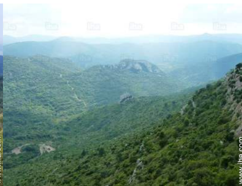
view over the countryside