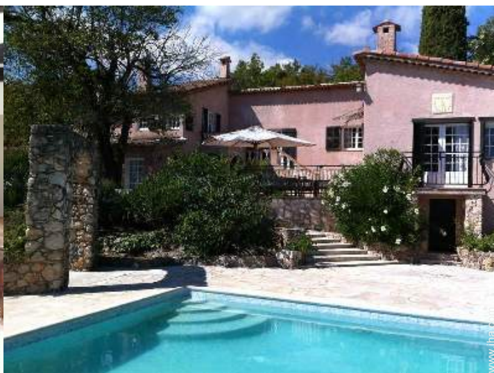
Charming Provencal House