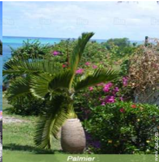
Palmier tropical garden