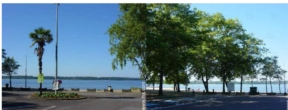
view over the lake