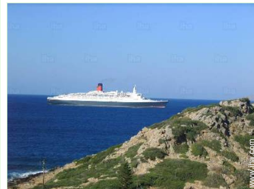
view from the balcony