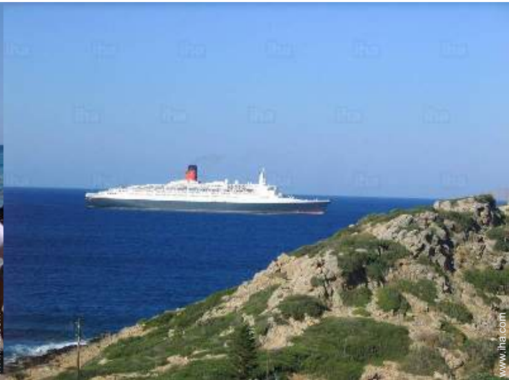
view from the balcony