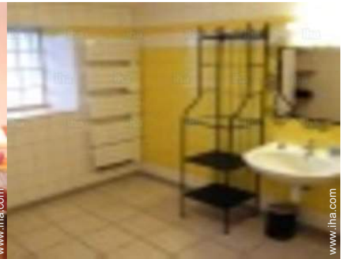
Interior layout and facilities