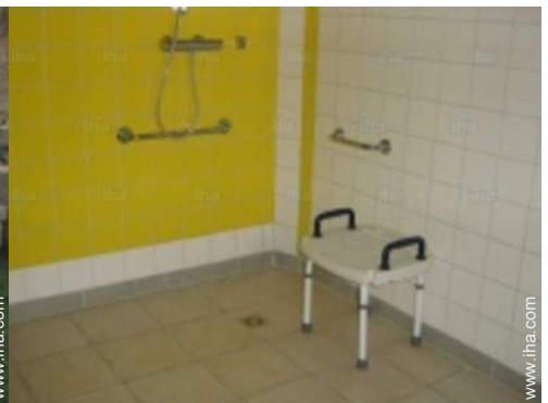
Interior layout and facilities