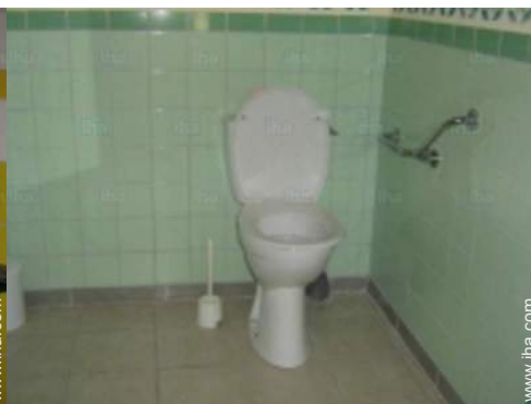
Interior layout and facilities