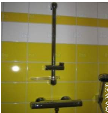
Interior layout and facilities