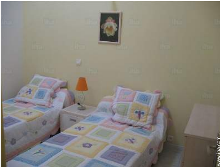
two twin beds