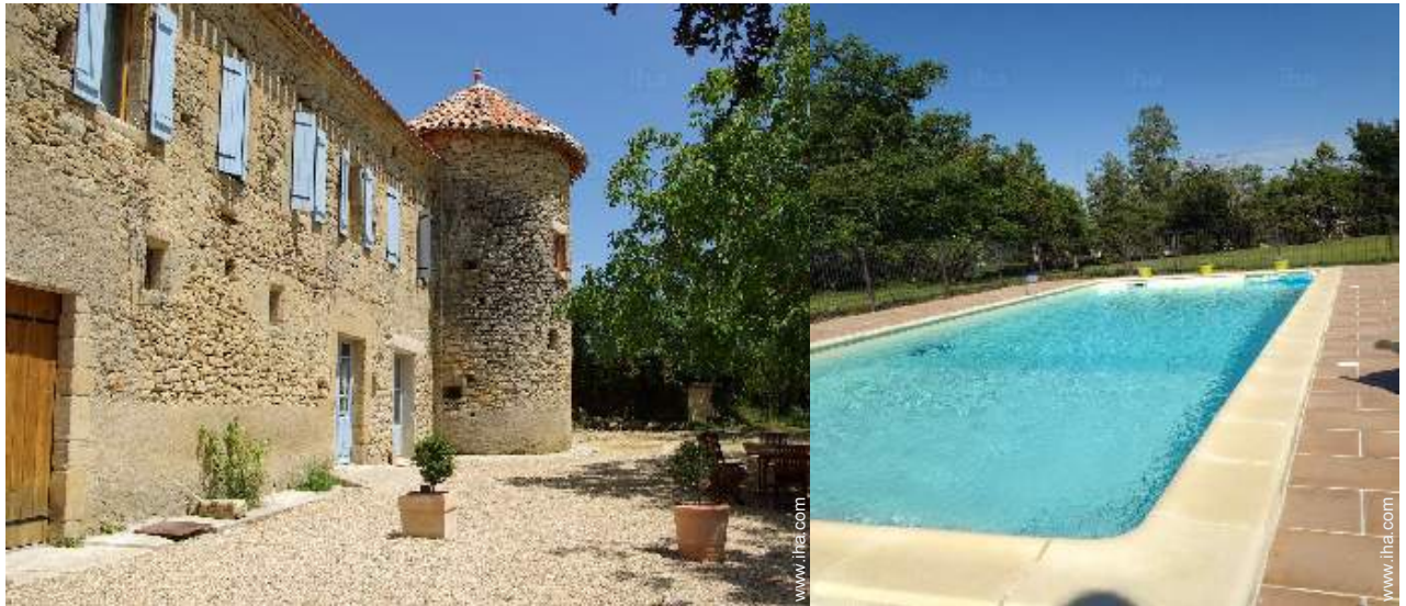
private swimming pool