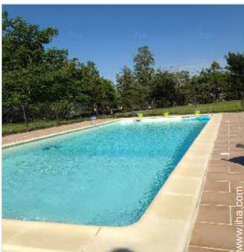
private swimming pool