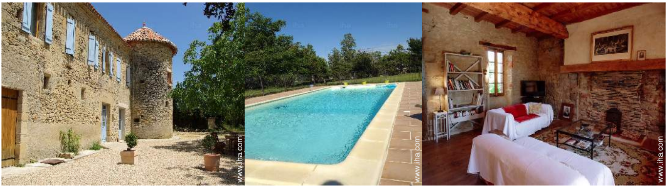
private swimming pool