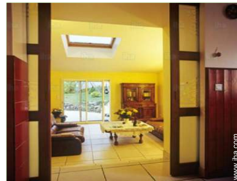
view from the living room

Village center 660' Bus stop / bus station 660' Bike/mountain bike hire 0.62mi. Breadstore 660' Caterer 4.5mi. Local stores 660' Supermarket 4.5mi. High class retailers 6mi. Hairdressing salon 6mi. Mail office 0.62mi. Bank 0.62mi. ATM 0.62mi. Drugstore 0.62mi. Doctor 0.62mi. Nurse 0.62mi. Hospital 6mi.