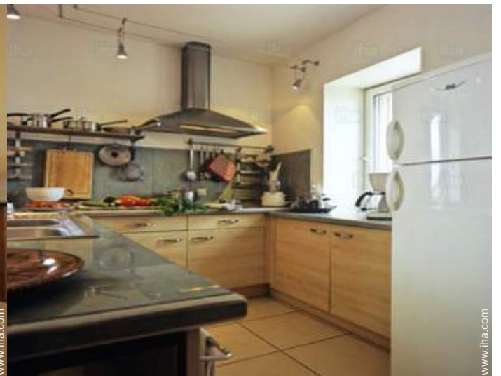
view from the kitchen