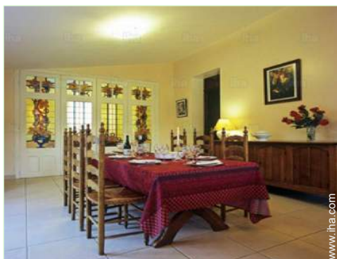
view from the dining-room