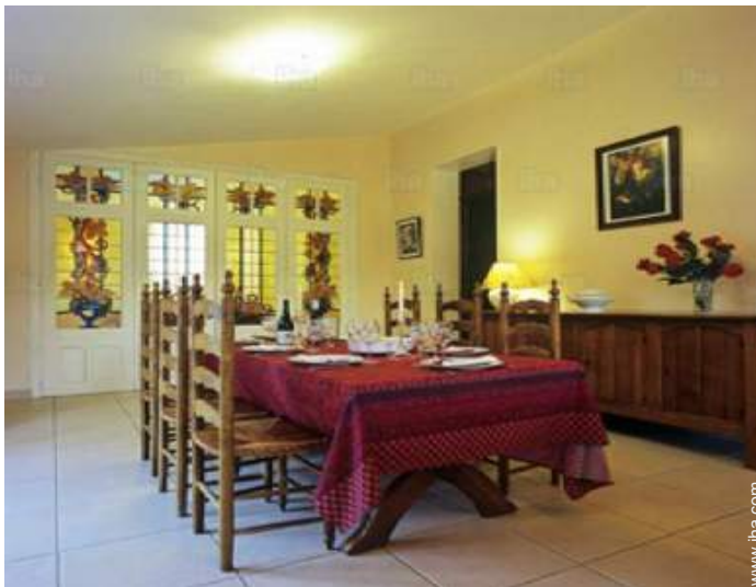
view from the dining-room