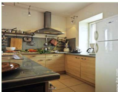
view from the kitchen

Crockery/flatware, kitchen utensils, cafetiere, electric coffee maker, electric kettle, toaster, food processor, meat broiler, electric hobs, oven, micro-wave oven, extractor hood, refrigerator, deep freeze, dish washer, washing machine, clothes dryer, vacuum cleaner, iron, ironing board