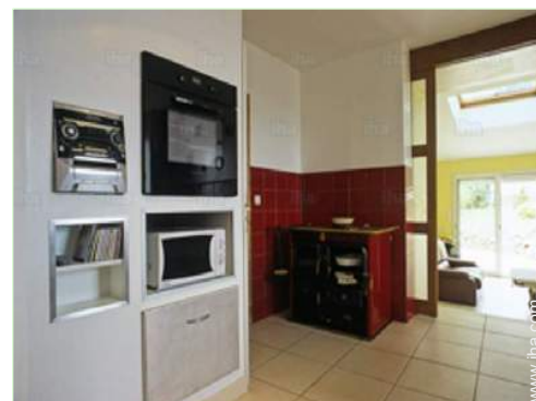
view from the kitchen

BBQ, yard table(s), 20 yard seat(s), parasol, child's swing