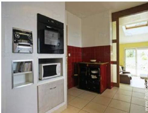
view from the kitchen