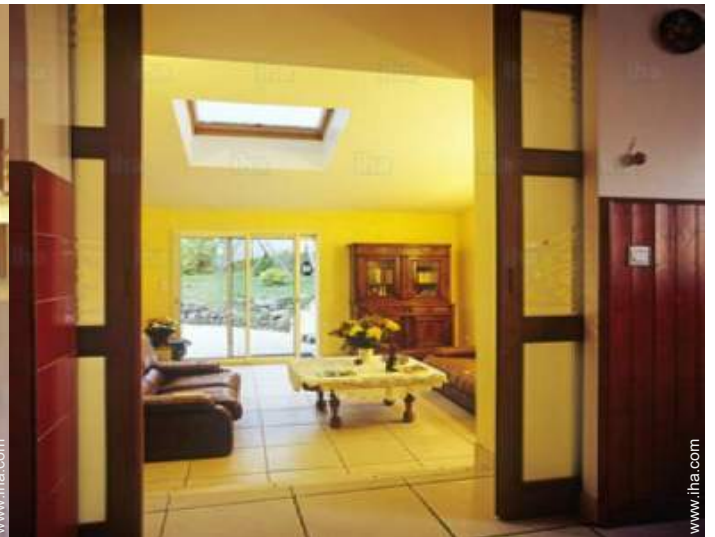
view from the living room