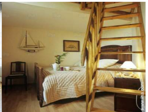
view from the bedroom