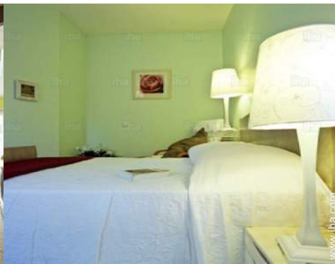
view from the bedroom