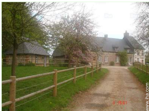
general floor plan