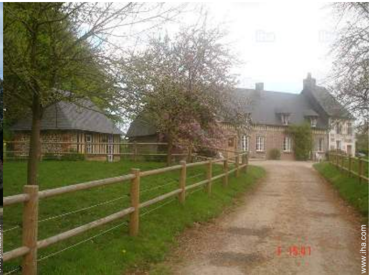
general floor plan