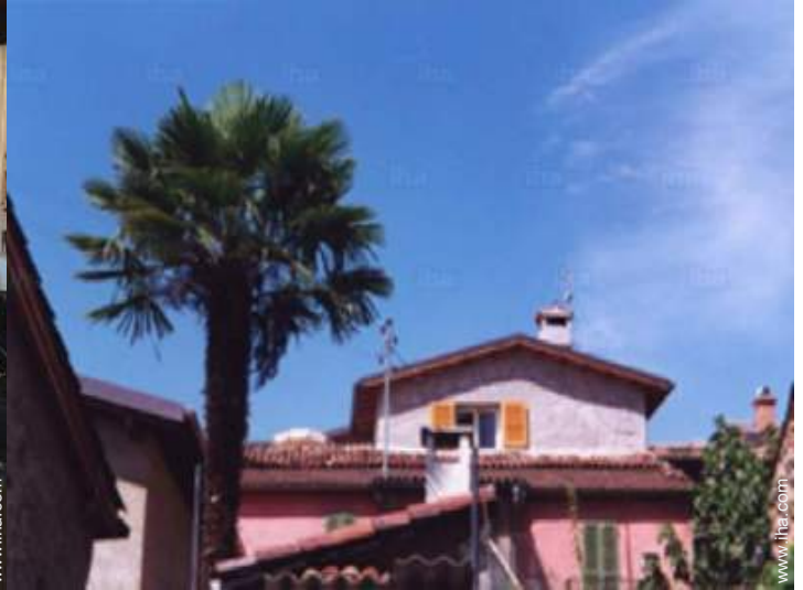
Charming Stone-Built House