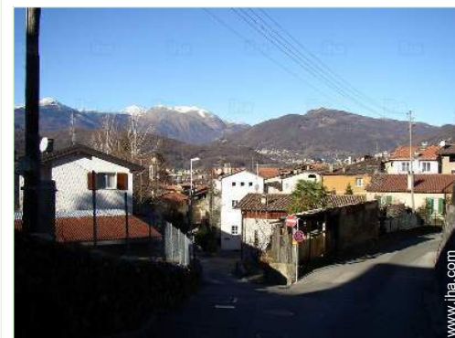
view of the village

Household linens for hire/laundry services 1.85mi. Breadstore 330' Caterer 330' Local stores 330' Supermarket 0.93mi. High class retailers 2.5mi. Hairdressing salon 1.85mi. Internet cafe 3mi. Mail office 330' Bank <165' ATM 0.62mi. Drugstore 0.3mi. Doctor 0.3mi. Hospital 3mi. Dispensary 3mi.