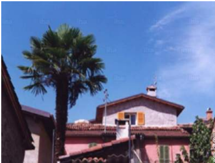
Charming Stone-Built House