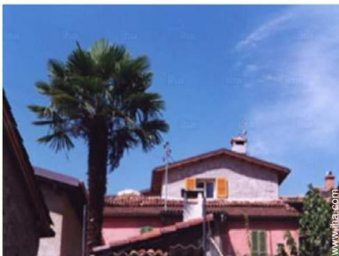
Charming Stone-Built House