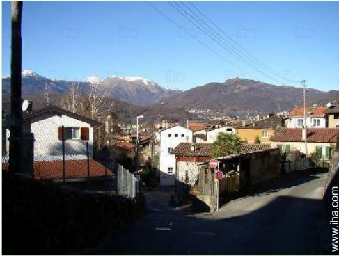
view of the village