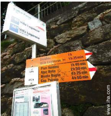
bus stop / bus station