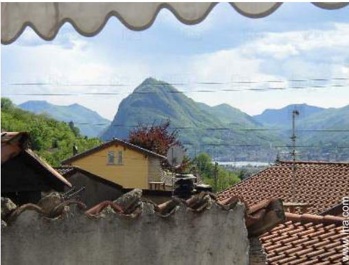
view over the lake