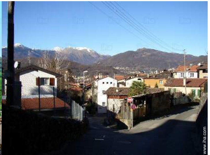
view of the village