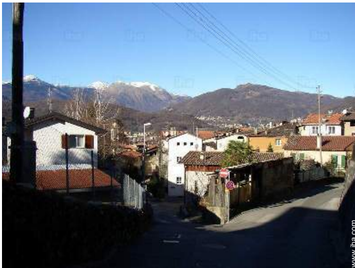
view of the village