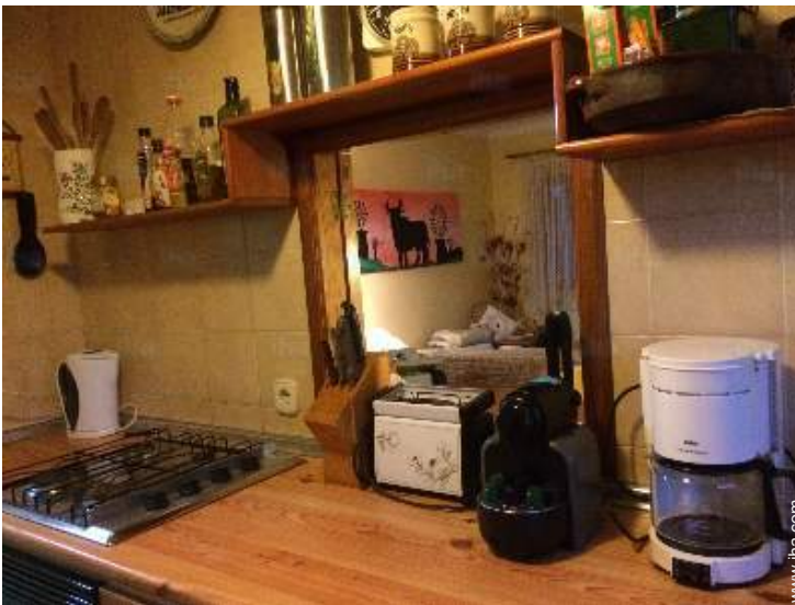
Interior comforts at guests disposal