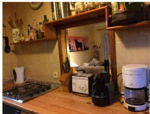
Interior comforts at guests disposal