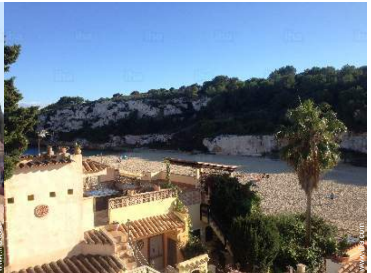
view from the roof terrace