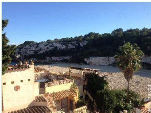
view from the roof terrace