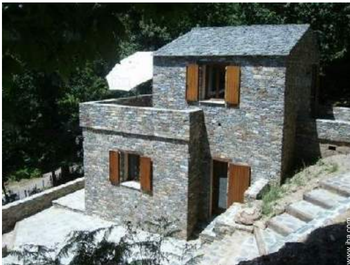
view over the mountain