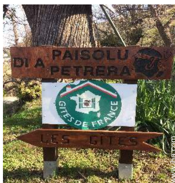
Present on site