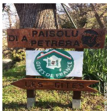
Present on site