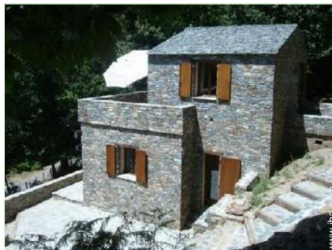
view over the mountain