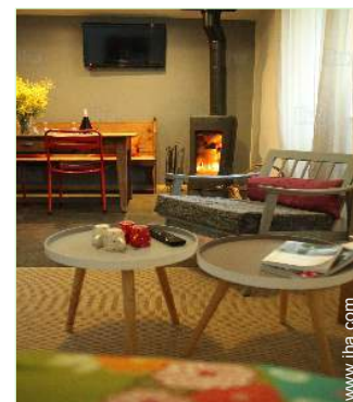
Single family home

Waterfall 6mi. River 3mi. Forest <165' Via ferrata-alpinism 6mi.