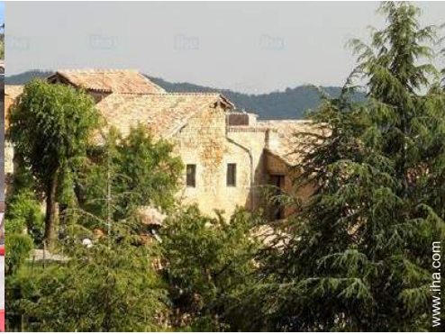
Single family home