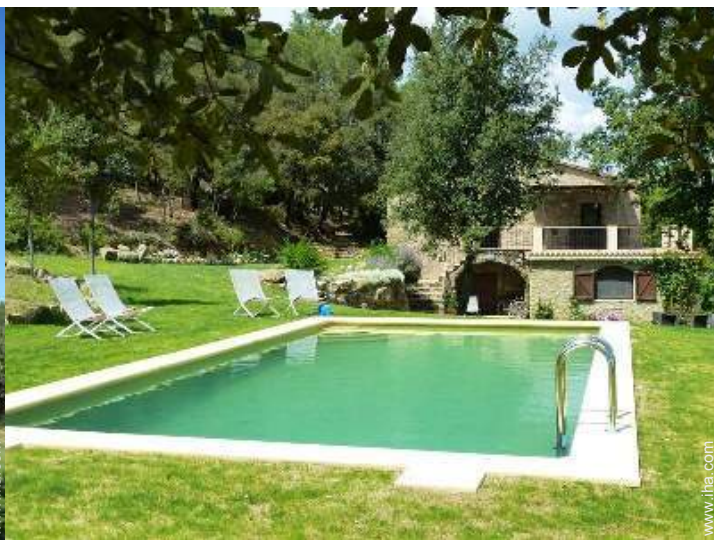
Exterior facilities at guests disposal