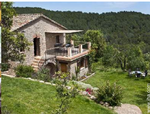
view from the garden/park