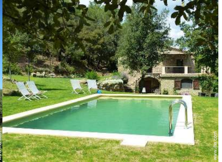
Exterior facilities at guests disposal