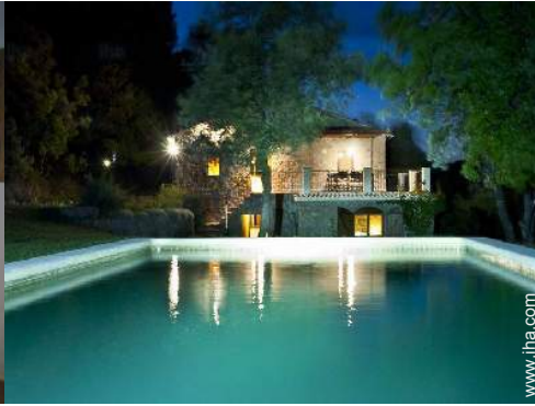
view from the garden/park