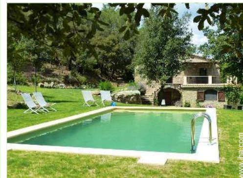
Exterior facilities at guests disposal