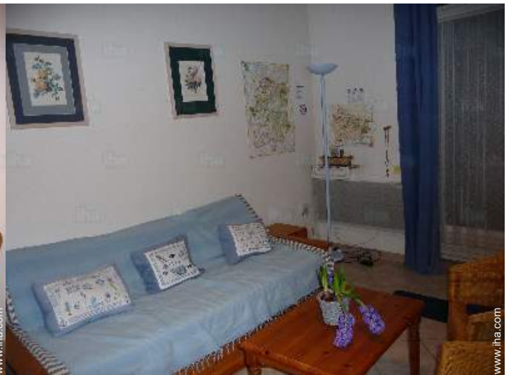
sleepers sofa(s) 2 pers