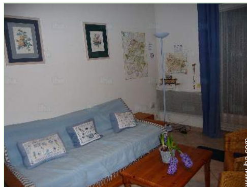
sleeper sofa(s) 2 pers