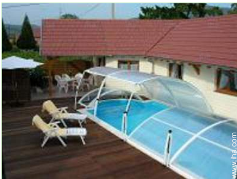
Covered swimming pool