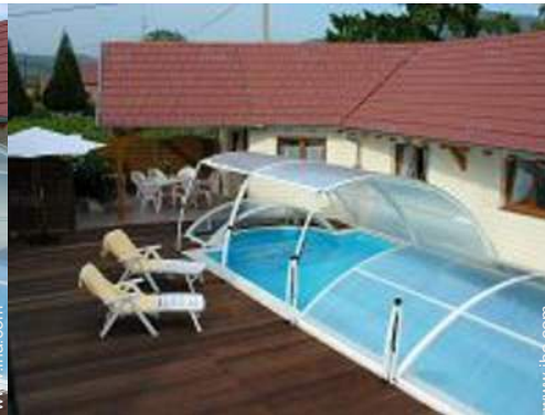
Covered swimming pool