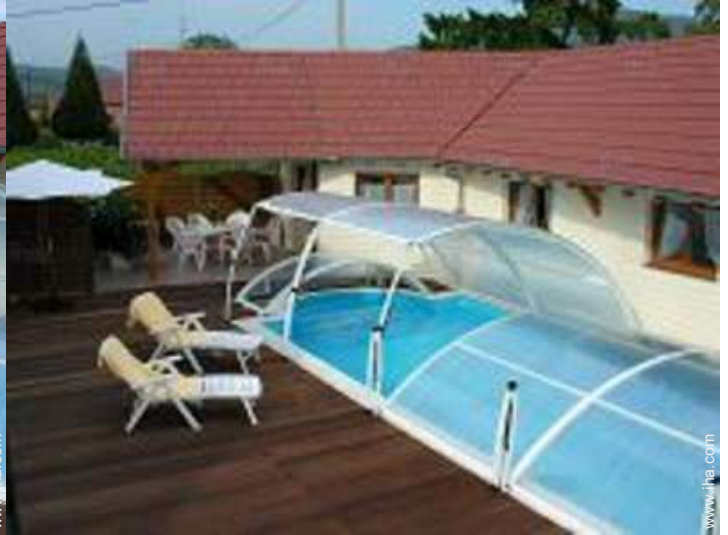
Covered swimming pool