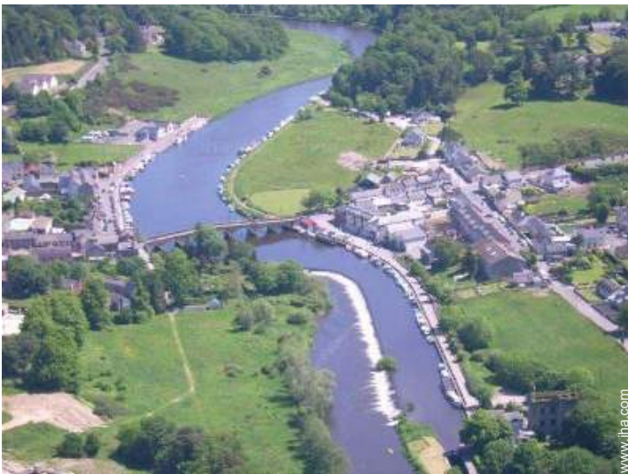
view over the river