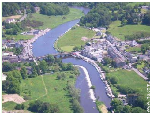
view over the river