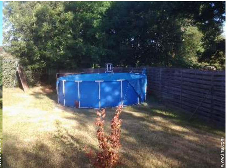
Round swimming pool