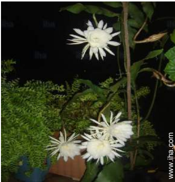
view from the covered terrace