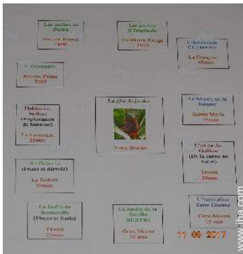
park and garden