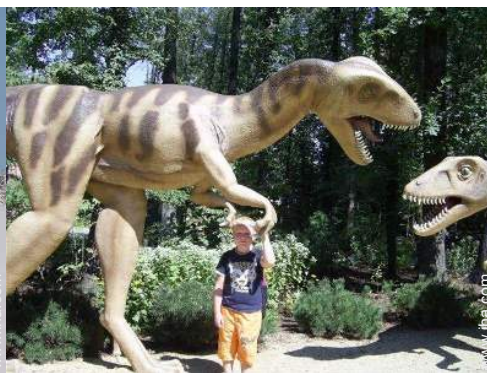
Attractions and relaxation