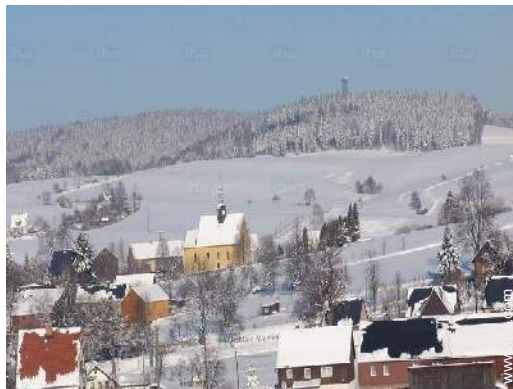
view of the village