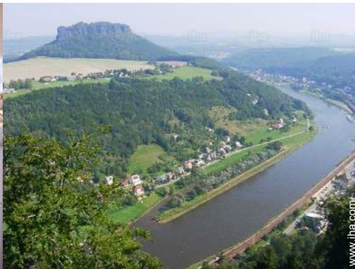
view over the mountain