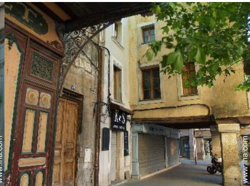
the apartment house/building