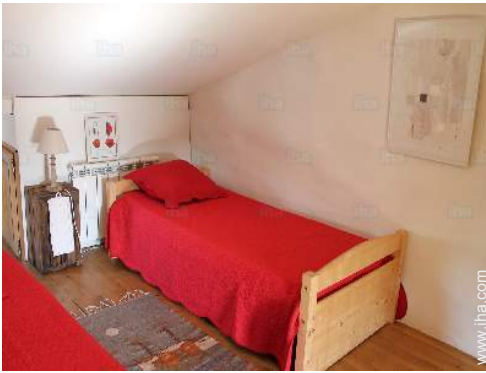
two twin beds