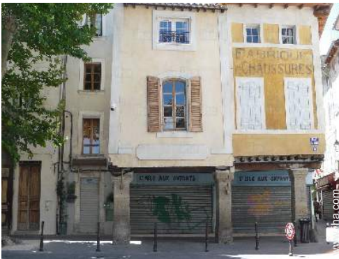
Restored apartment house/building