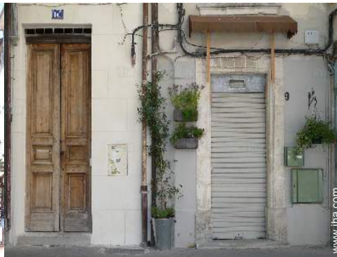
the apartment house/building