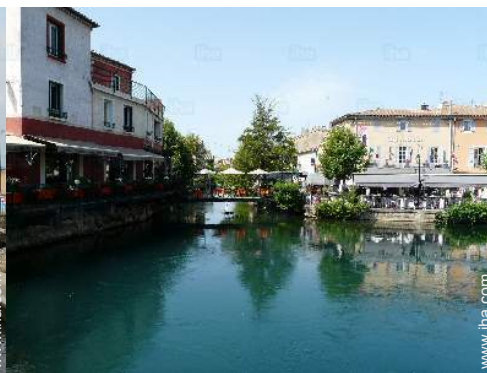
view of the city