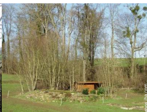
view from the sitting-room