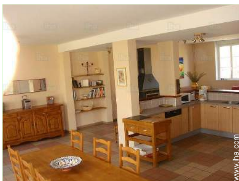
american style kitchen