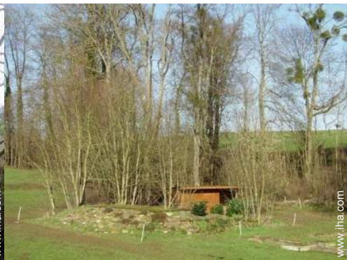
view from the sitting-room