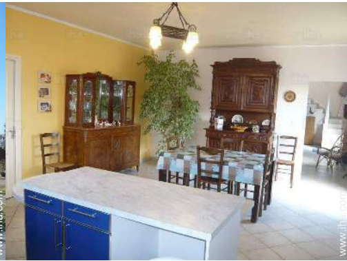
large separate kitchen