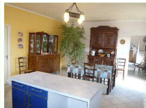
large separate kitchen