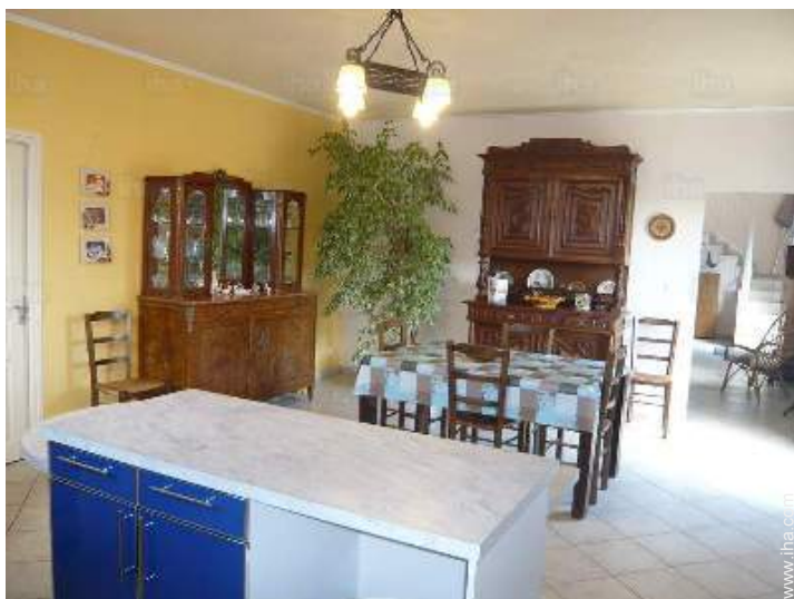
large separate kitchen