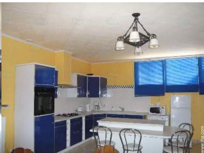
large separate kitchen