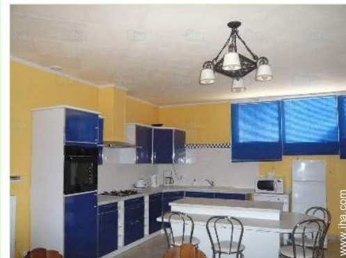
large separate kitchen

Public swimming pool 660' 9 hole golf course 12.5mi. 18 hole golf course 12.5mi. Flying clubs 15.5mi. Watersports centre 15.5mi. River 660' Stretch of water 0.3mi. Forest 1.25mi.