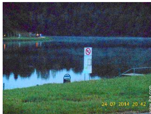
seaside pursuits nearby