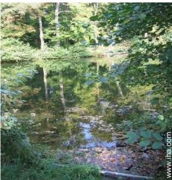
view over the river