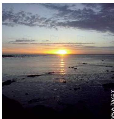
view over the ocean