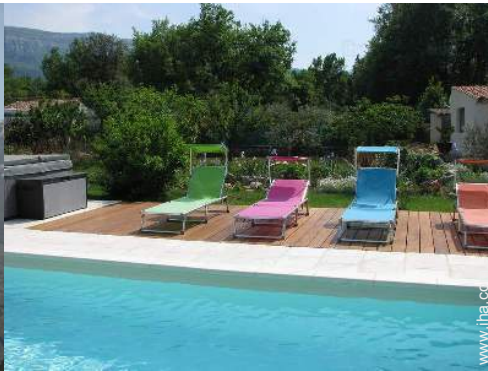
Exterior facilities at guests disposal