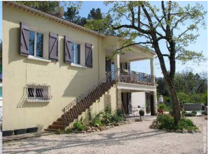
Single family home