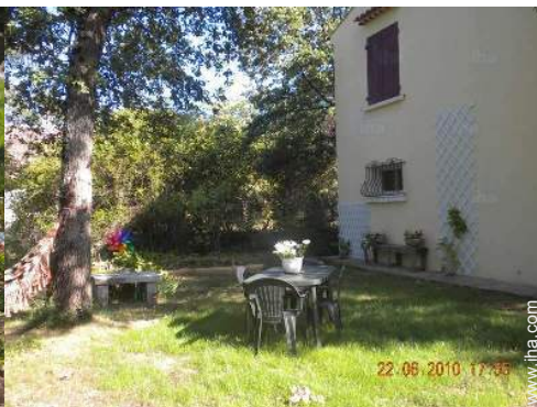
Exterior amenities at guests disposal