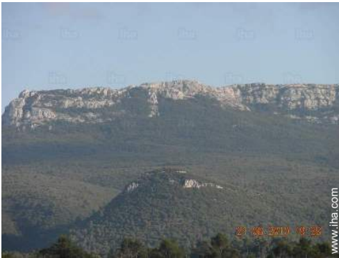
view from the balcony