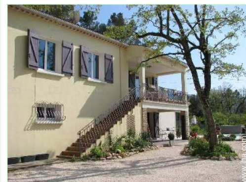
Single family home