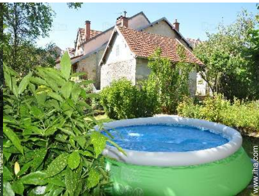
Exterior amenities at guests disposal