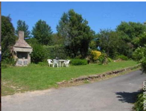
Exterior facilities at guests disposal