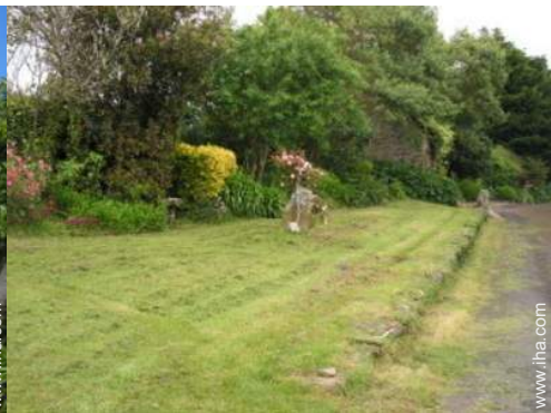
Outside at the guests disposal