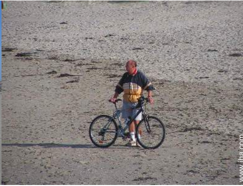
bike/mountain bike hire