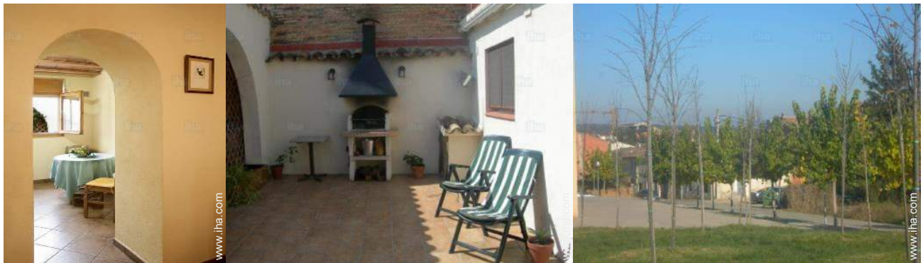
view from the dining-room