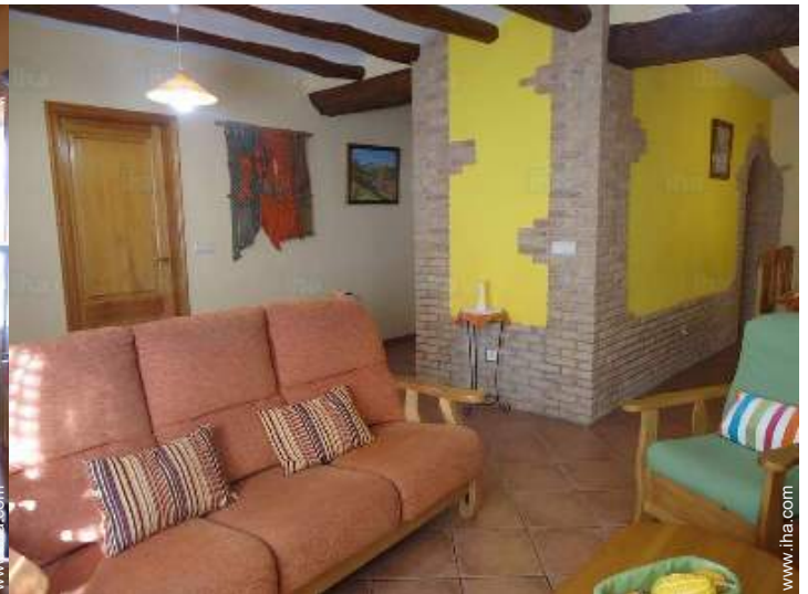
view from the sitting-room