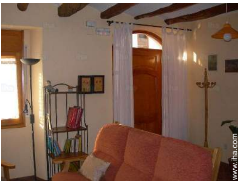
view from the sitting-room