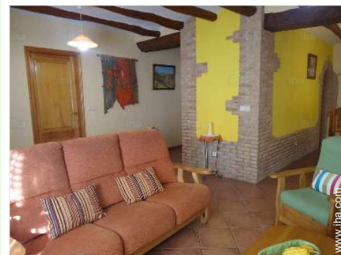
view from the sitting-room