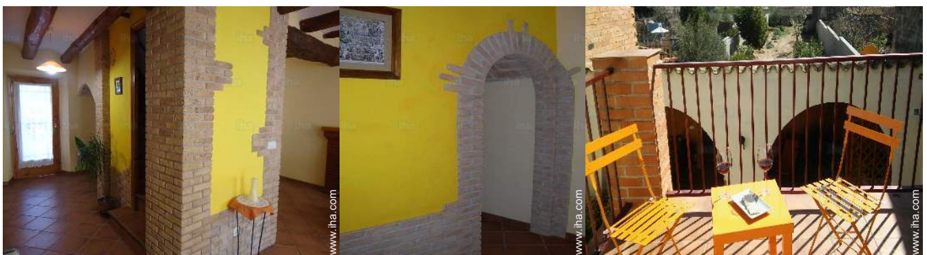
view from the sitting-room