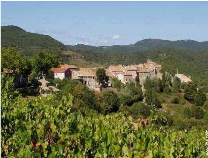
flying pursuits nearby