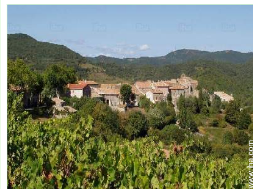
flying pursuits nearby