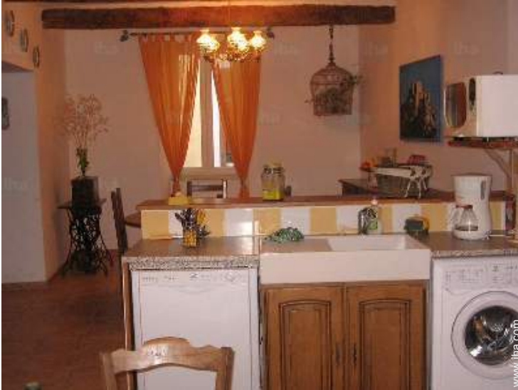
american style kitchen