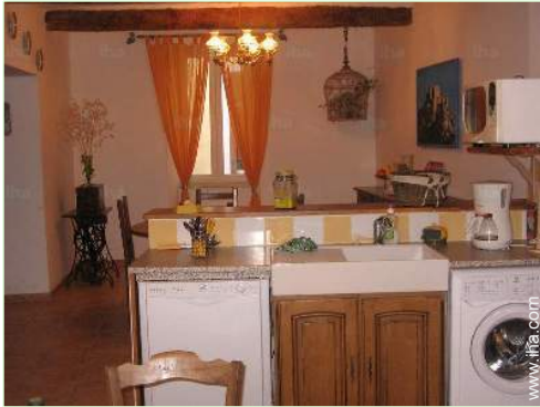
american style kitchen